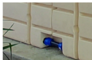
2 tanks connected with tank to tank connection kit

IMPORTANT: Thread tape should be used on all couplings and ball valves.