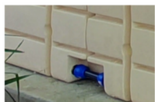
2 tanks connected with tank to tank connection kit

IMPORTANT: Thread tape should be used on all couplings and ball valves.